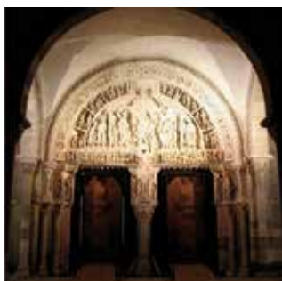
Le narthex A place where pilgrims could prepare themselves at the front of the nave. On the tympanum of the arched door stands the Christ in his glory.

Since 2005 it is possible to walk from Vézelay to Assisi in Italy, birthplace of saint Francis of Assisi, the founder of the Franciscan order.