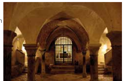
La crypte Located under the altar the crypt contains Mary Magdalene's relics.