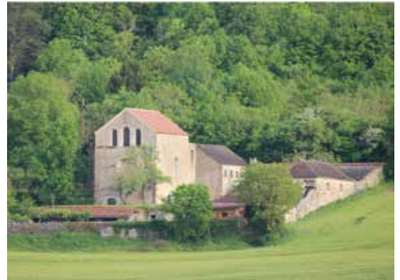
La Chapelle de la Cordelle Situated on the north side of the hill. First Franciscan hermitage in France