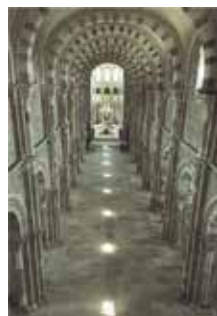
Chemin de lumière The path of light. On the 21st of June, at noon solar time, the sun shines through the high stained glass windows making a path of light on the floor of the nave.